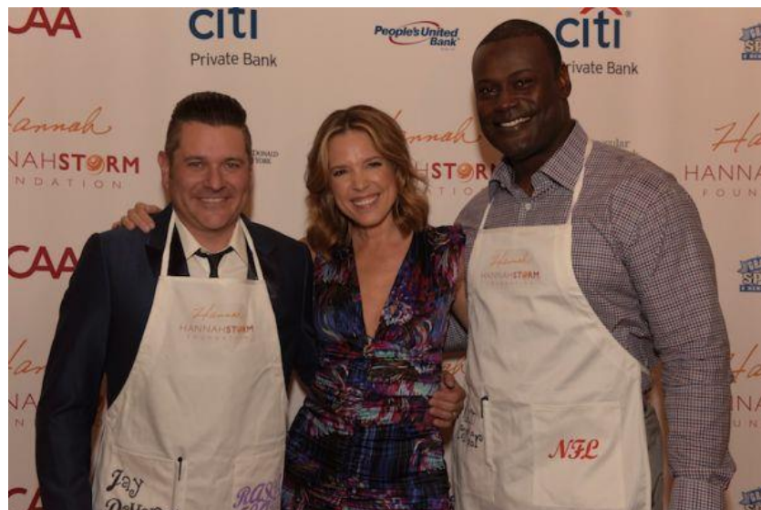
Rascal Flats' Jay DeMarcus, ESPN SportsCenter anchor Hannah Storm and Kevin Carter, ESPN/ESPNU college football analyst and former NFL player, help raise funds during Celebrity Waiter Night on Tuesday, Oct. 27, 2015, at New York Athletic Club in Manhattan. The proceeds go to help kids in need of surgery for vascular birthmarks.